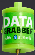
Rapid RH L6 system, including the Rapid RH L6 Sensor and the DataGrabber with Bluetooth