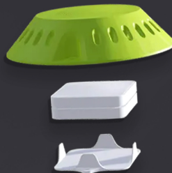
Rapid RH DataGrabber Range Extender (DGRE) and Protective Dome