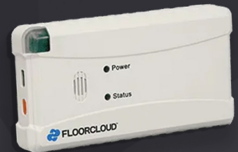
Floorcloud Jobsite Conditions Sensor

For more information about the Rapid RH L6 family of products, call the Wagner Meters sales team toll-free at (800) 634-9961.